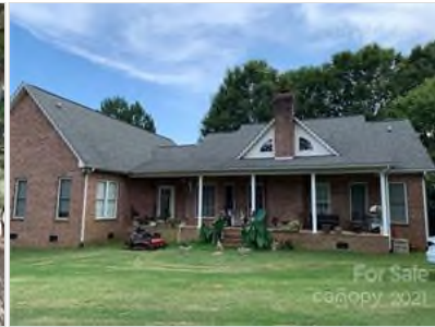
REAR OF HOME