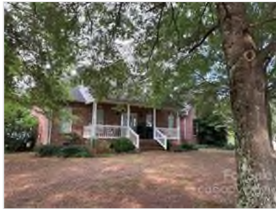
FRONT OF HOME

Listing Information DOM: 0 CDOM: 0 Closed Dt: UC Dt: DDP-End Date: Close Price: Slr Contr: LTC: